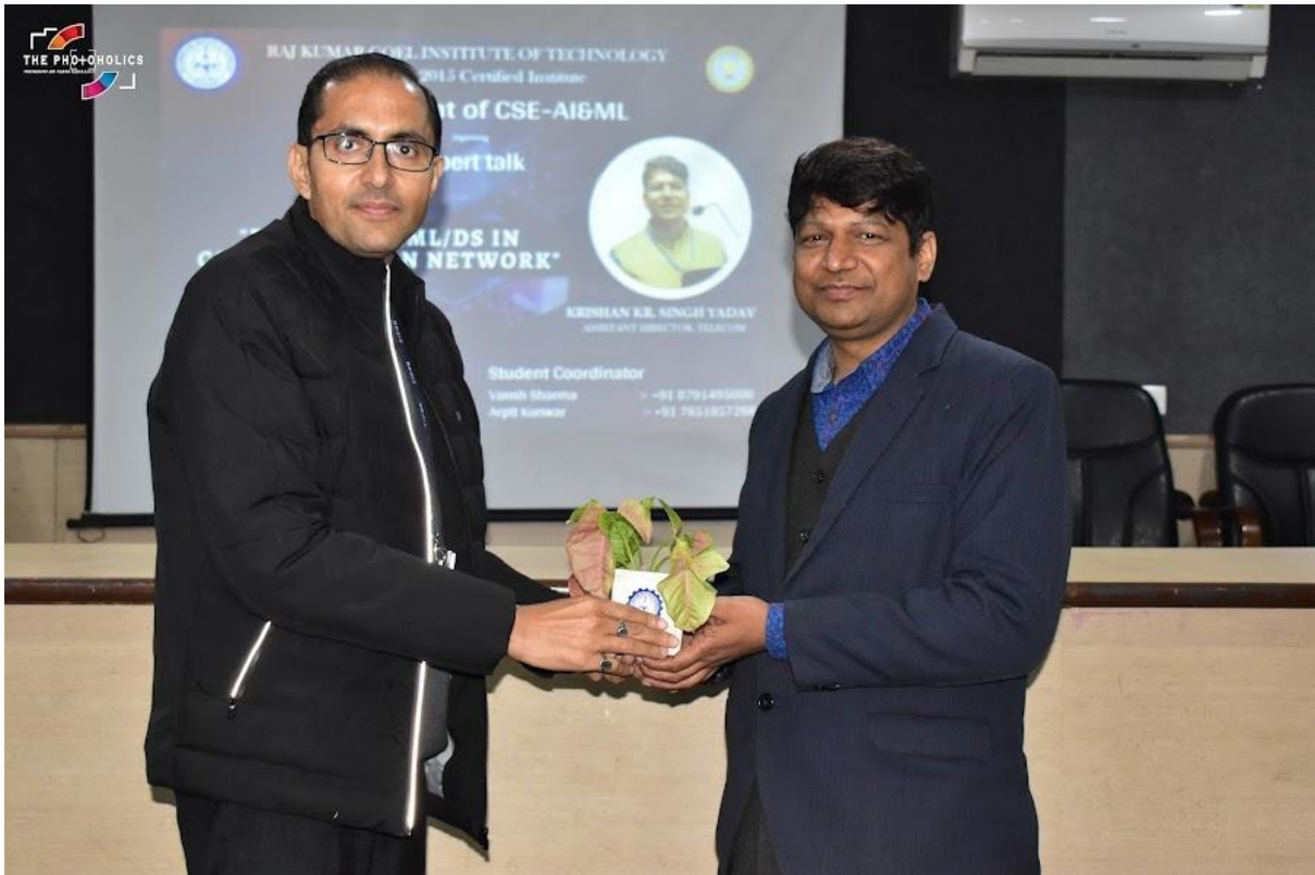
Some Pics of the Event - Session on "Entrepreneurship in Communication Network"