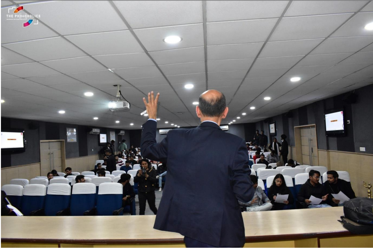
Organized a one-day workshop on "Problem Solving and Ideation"