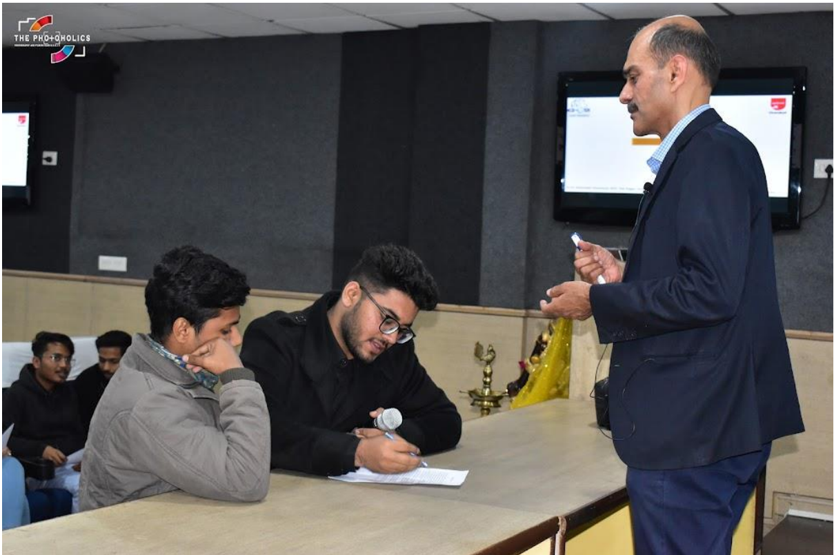
(Some Pics of the Events - Session on Problem Solving and Ideation Workshop)