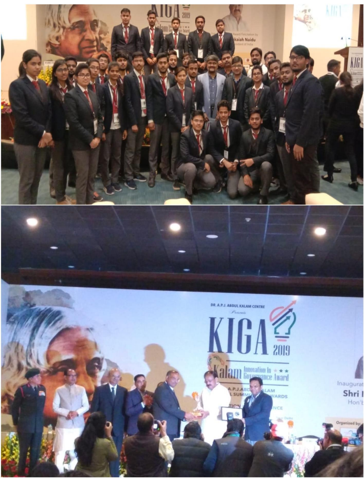
OUTCOME: The event was successfully held at PRAVASI BARTIYA BHAWAN, CHANAKYAPURI. The students were motivated to think innovatively and do their best. The evening was felicitated by many dignitories. It was an interactive session where all the students from different parts of the states interacted with each