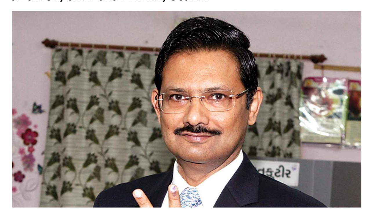
K SHRINIVAS, ADDL SECERETARY, DoPT, GOVERNMENT OF INDIA